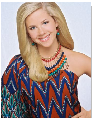
Jennifer 2014 Ultimate

Get your $100 deposit in to save your spot in lineup!